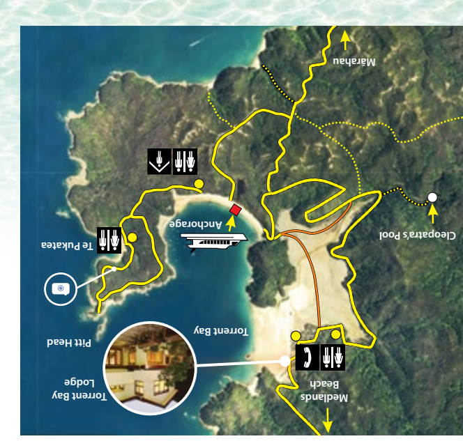
PITT HEAD - ANCHORAGE BAY